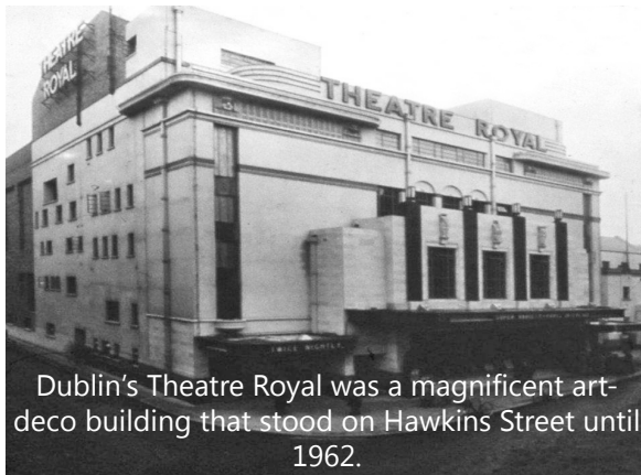
Dublin's Theatre Royal was a magnificent art-deco building that stood on Hawkins Street until 1962.

T he fourth Theatre Royal opened on 23 September 1935. It was the biggest theatre and had the largest stage in Europe. "The Royal", as it was affectionately known, was regularly filled to its capacity of four thousand patrons.